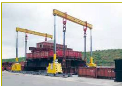
< SL-400 Gantry during load testing